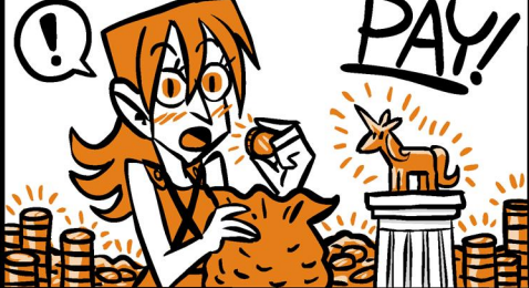
AND INTRODUCING MANIA!

DO WHATEVER YOU MAY, BUT THERE AIN'T NO TIME TO PLAY!